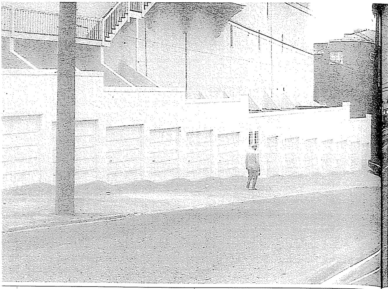
Garages tucked under apartments line a San Francisco street.